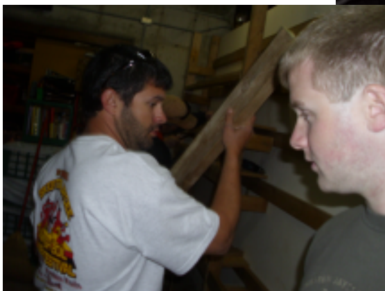
Above: Sikeston Jaycees building shelves at Wonderland Camp.

I look forward to seeing you all in my travels. Please remember to let me know about any projects you have planned for the camp or a project you need help at. I will try my best to make it to the events but my calendar is pretty full, if I can arrange things to make it work, I will!