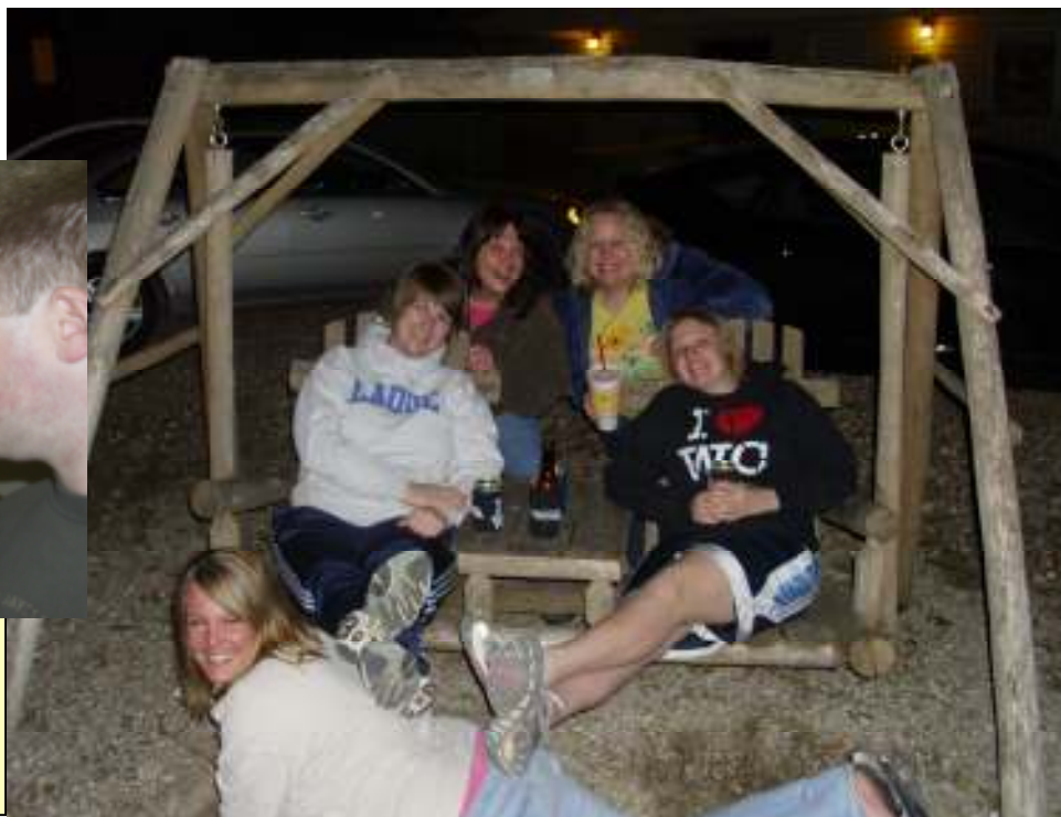
Right: St. Charles Jaycees relaxing after work at Wonderland Camp.