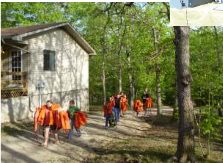
Above: At Wonderland Camp, even the kids had to pitch in and work.