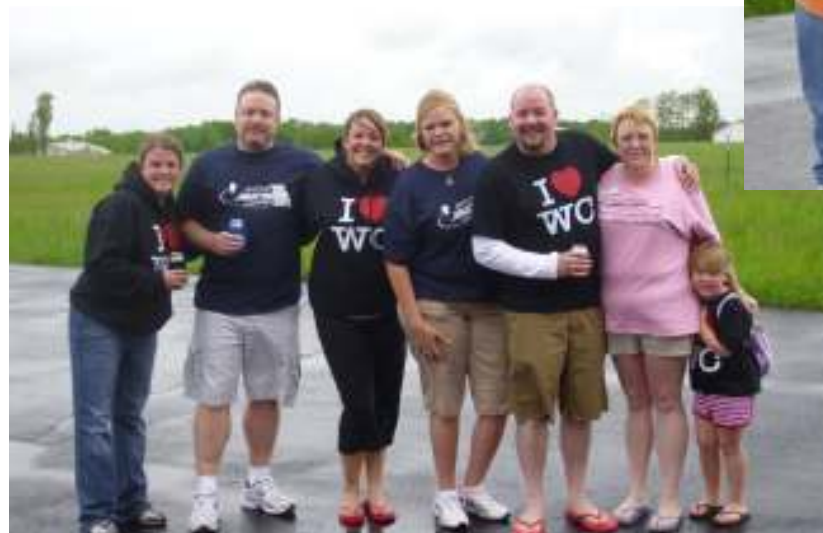
Jaycees Senate Wacky Olympics teams at the Macon state meeting.