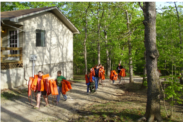
Above: Kids working at Wonderland Camp.