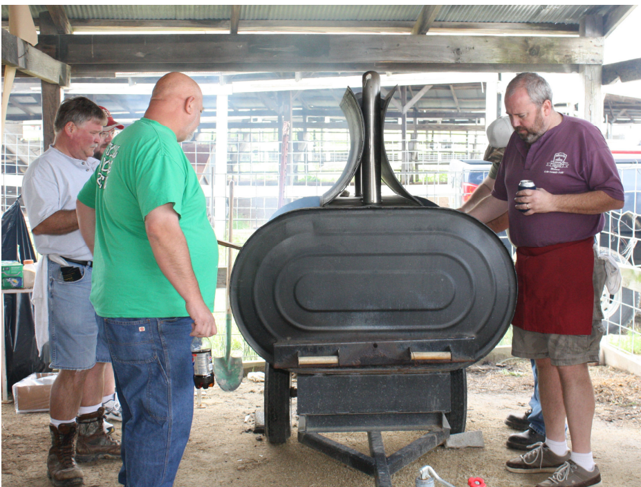
Left: Jaycees senators cooking for the Wonderland Camp Truck and Tractor Pull.