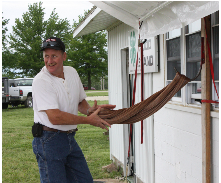
Above: Taffy pulling at the Wonderland Camp Truck & Tractor pull.

Feed the members/volunteers. Food is a great motivator and shows that you appreciate their hard work. It can be as simple as having coffee and soda available for meetings to feeding them lunch or dinner while they're working for our programs