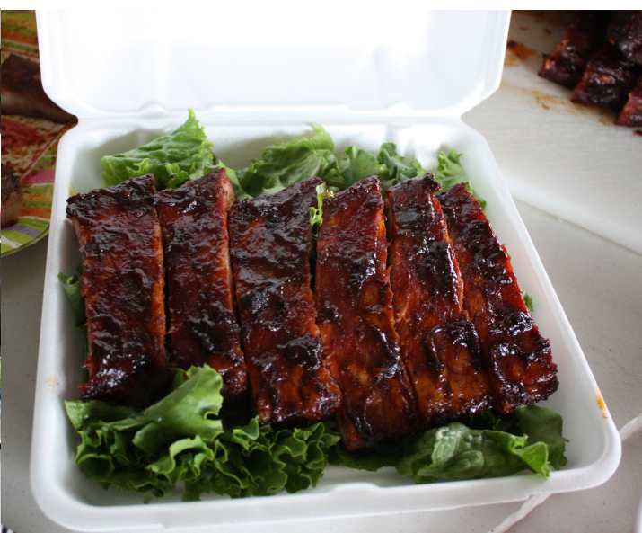
Bottom right: The finished ribs.