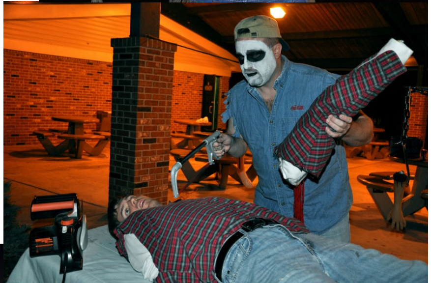
Top: A creepy scarecrow comes to life at the St. Charles Jaycees' Haunted Hayride.