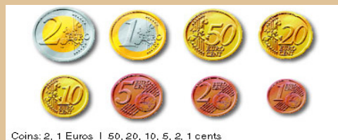
Coins: 2, 1 Euros | 50, 20, 10, 5, 2, 1 cents