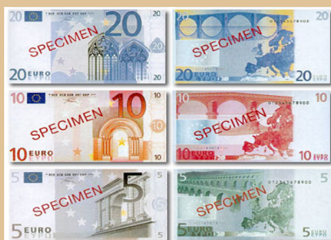
Notes: 500, 200, 100, 50, 20 10, 5 Euro (Euros)