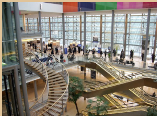
Leipziger Messe (Congress Center Leipzig)